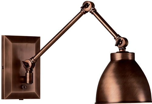
Maggie Swing Arm 8471-AR-MS