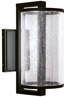
Candela Large Sconce 1230-MB-SE