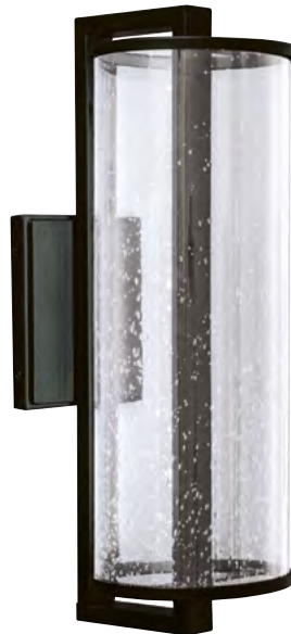
Candela Large Sconce 1231-MB-SE