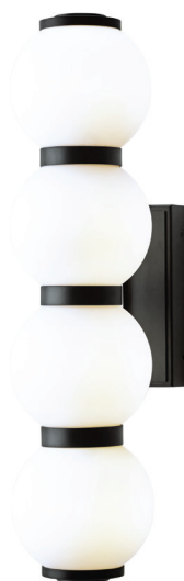
Matte Black / MB