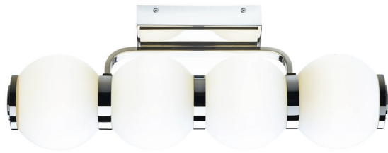
Chrome / CH